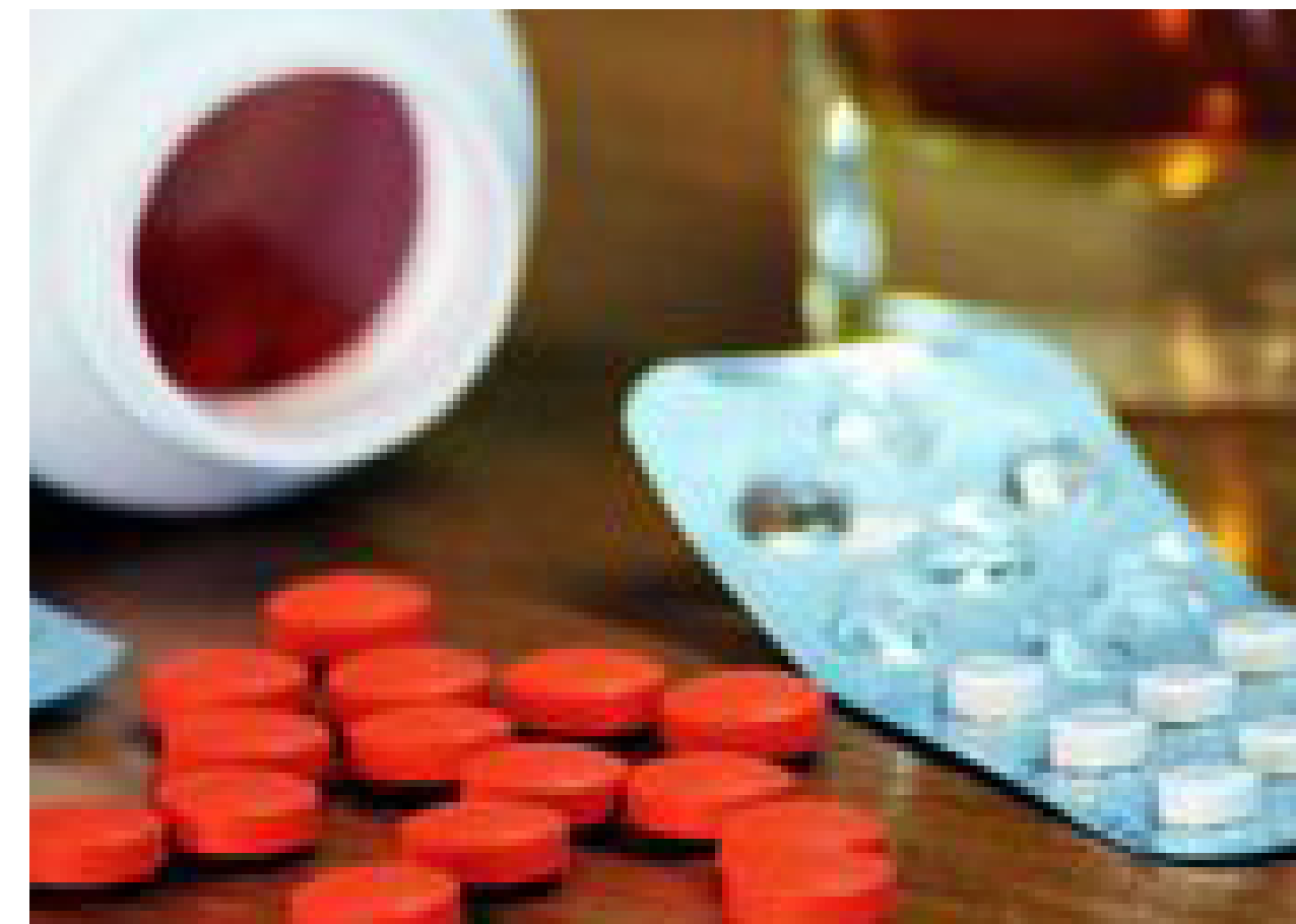
566 Deaths from Overdoses