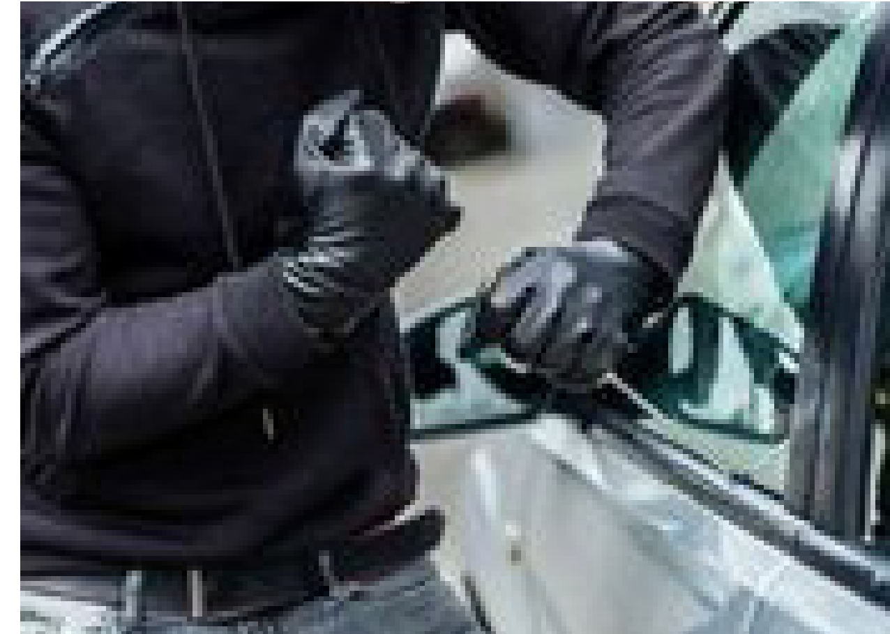
454 Motor Vehicle Thefts