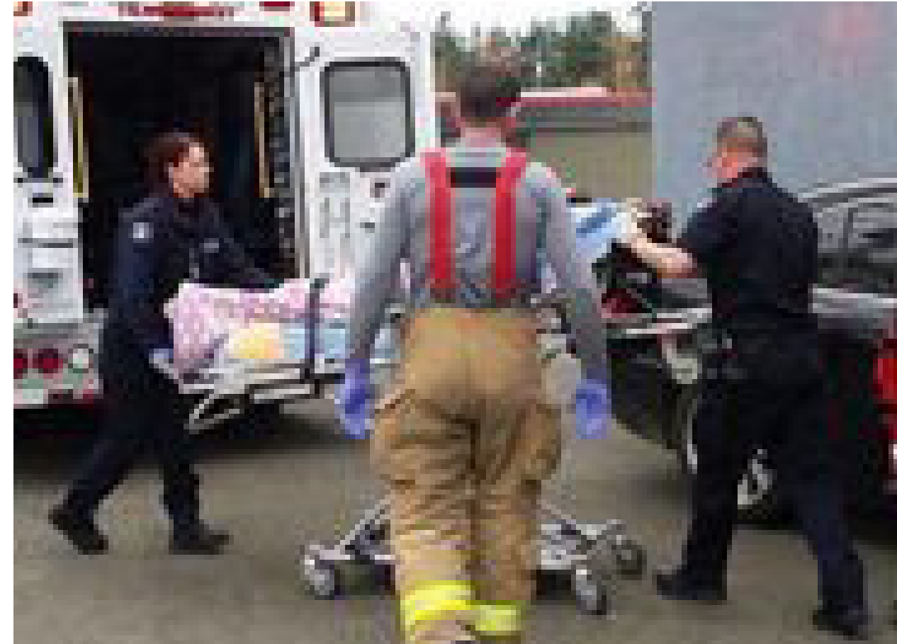
873 Violent Crimes

SOURCE SEPTEMBER, 2020 FBI WEST PALM BEACH