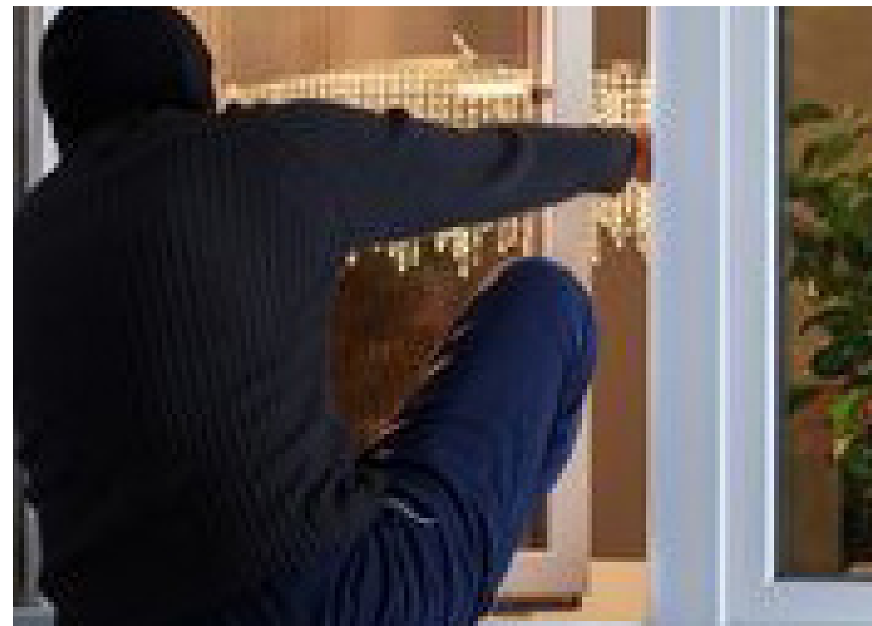
4,257 Property Crimes